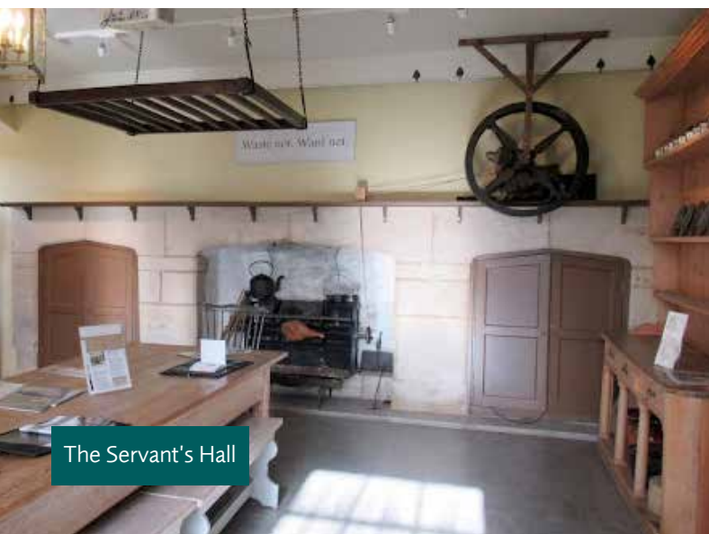
The Servant's Hall